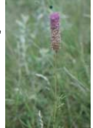
Purple Prairie Clover