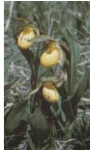
Small Lady's Slipper Orchid

Athyrium filix-femina Botrychium minganense Campanula aparinooides Carex lasiocarpa Carex leptalea Cypripedium parviflorum Cypripedium reginae Dryopteris carthusiana Dryopteris cristata Eriophorum viridicarinatum Galium labradoricum Menyanthes trifoliata Onoclea sensibilis Salix pedicellaris Thelypteris palustris